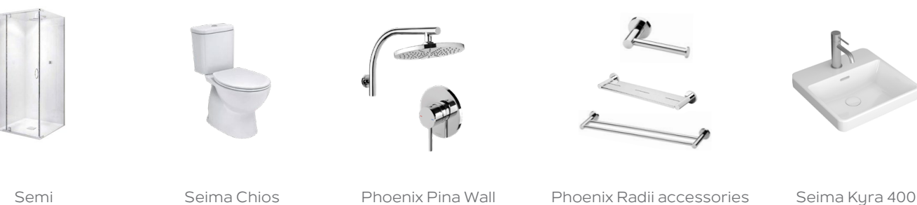
Semi frameless shower

Seima Chios Select Close Coupled Toilet Suite